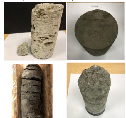
Soil and Rock Samples from Site B

particularly at low strains and the values were significantly affected by loading frequency applied using different testing methods. The effect of soil plasticity in relation to geologic age was evaluated for the shear modulus and damping, and no clear trend was observed for Tertiary and Cretaceous soil deposits. As a result, the shear modulus and damping behaviors were not accurately predicted by index properties for these soils. It is hypothesized that cementation is likely to be a significant factor affecting the dynamic soil behavior; however, detailed evaluation of cementation in relation to shear modulus and damping was beyond the scope of this study.